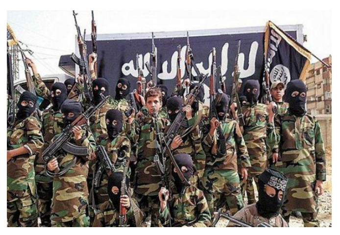
DAESH child soldier.

existence and growth of this terrorist group.