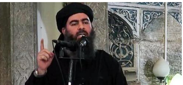
Abu Bakr al-Baghdadi (Samarra, Iraq. July 28, 1971).

Violence and indiscriminate savagery of the attacks by ISIS, Al Qaeda made in late