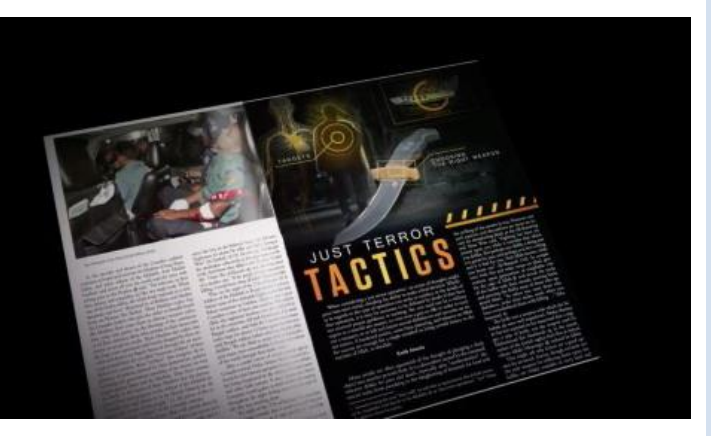
Manual terrorism.

Since the beginning of jihad ISIS, and the appointment of cyber unit of the Caliphate, the UCC, the mechanisms to do evil, they have changed. Before, with the armed guerrillas or terrorist groups currently engaged in training their soldiers and instruct them in the