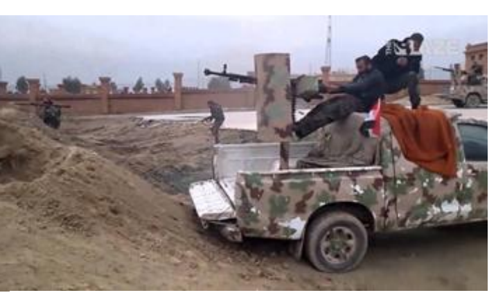
Pick Up the DAESH armed with powerful machine gun.

Caravans Pick Ups the DAESH with militia and artillery to antiaircraft machine guns NSV, DHSK even ZU-23 and recoilless guns, against an Iraqi army and Syrian gifted of tanks of Russian origin T-55 and T-72 including contribution of the Americans with