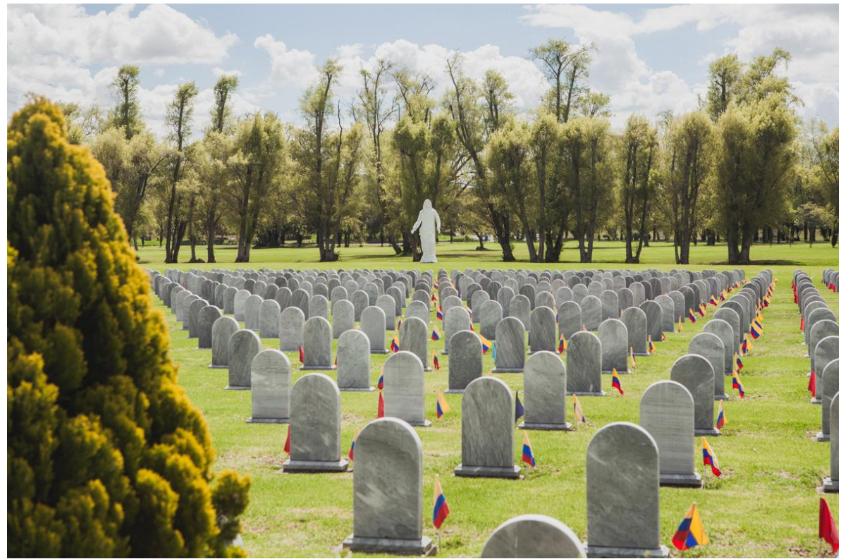
Military Cemetery in the city of Bogotá, Colombia.

That rest in peace (02-February-1965 to August 31, 1996)