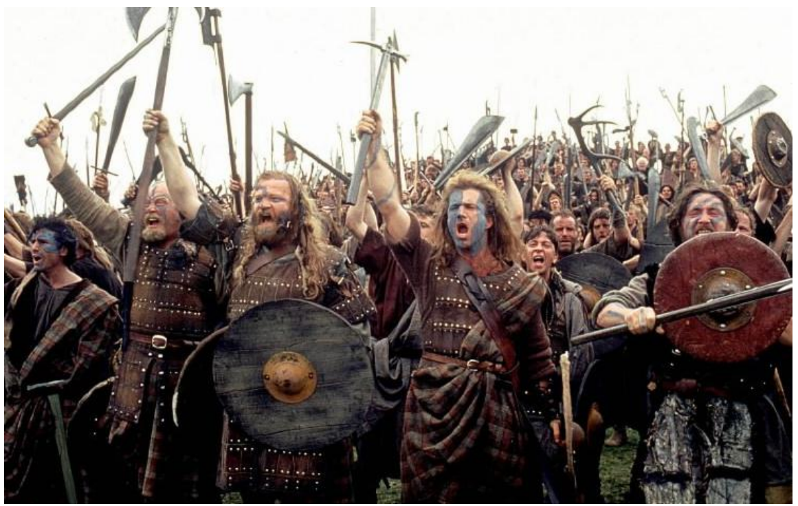
Scene from the movie "Brave heart"