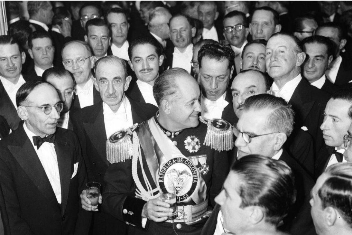
The General Gustavo Rojas Pinilla, with men of high Colombian society.