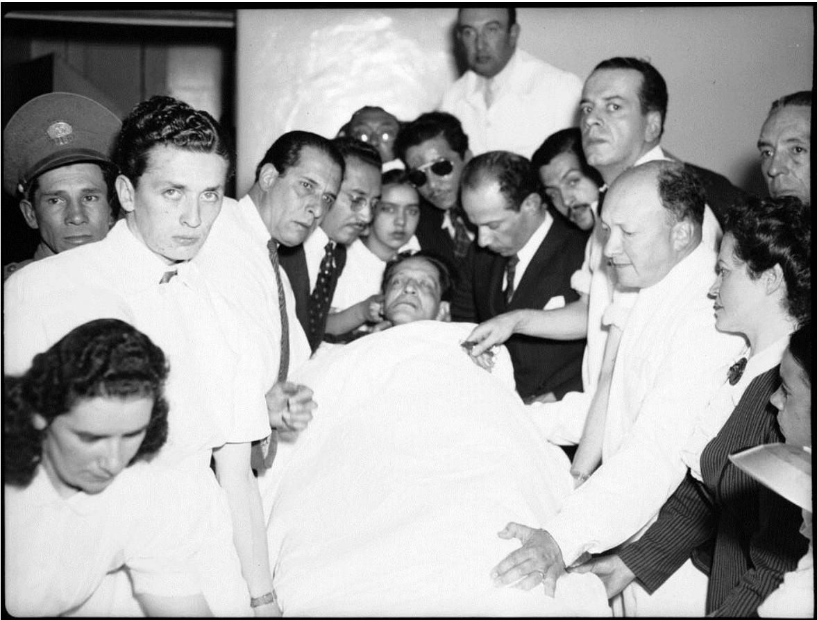
Body of Jorge Eliecer Gaitán along with doctors, police officers and other officials, who decided to take a macabre "selfie" inside the Medical Center where it took him.

To retire, President López Pumarejo allowed that his constitutional replacement, Alberto Lleras Camargo, took power as designated and convene elections for June 1946, same which were won by the conservative party.