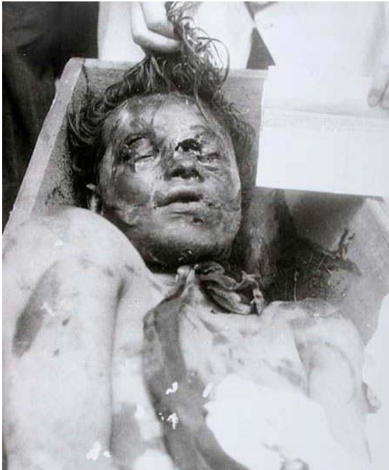
Juan Roa Sierra, the murderer of Gaitán, once lynched by the crowd.

horrible blood bath. After this event, the rural political violence that began with the possession of Mariano Ospina Pérez, moved to the cities.