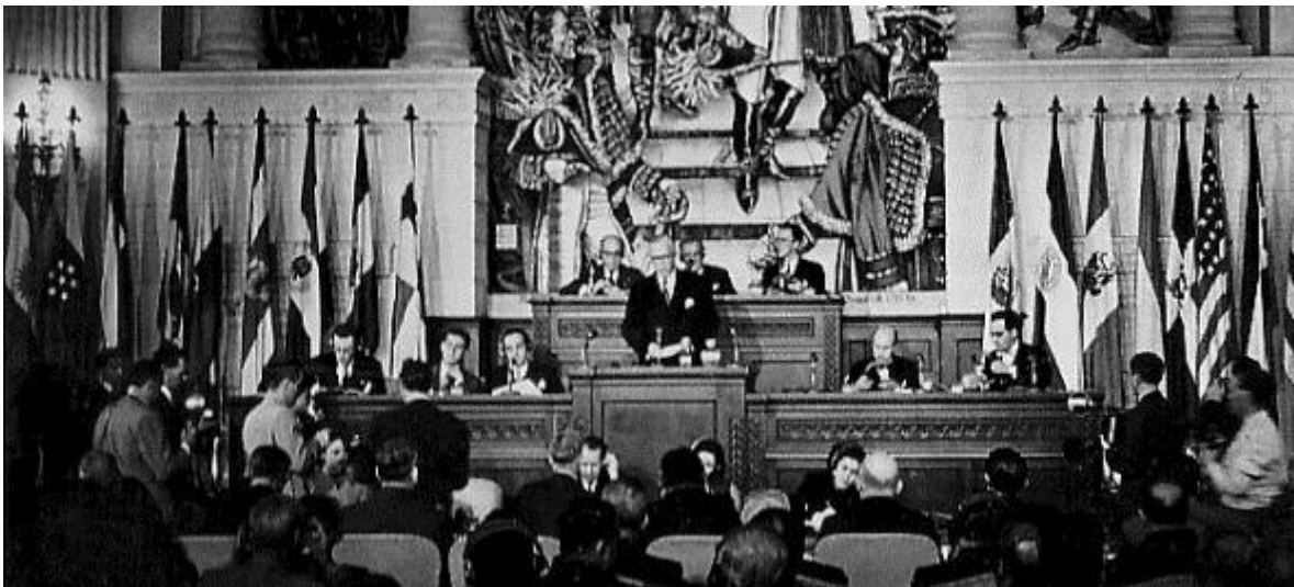
George Marshall speaks at the 9th Pan-American Conference in Bogotá, 1948

Under these circumstances, the prospects of the deliberations were uncertain until April 9, which allowed Marshall to discipline the Conference under the aegis of anti-communism and the pro-American alignment. The long hands of Americans came to suggest the bipartisan Cabinet, the removal of Laureano from the Government and slander that the Communists had killed Gaitán, which Ospina Pérez reported widely. (p.22)"