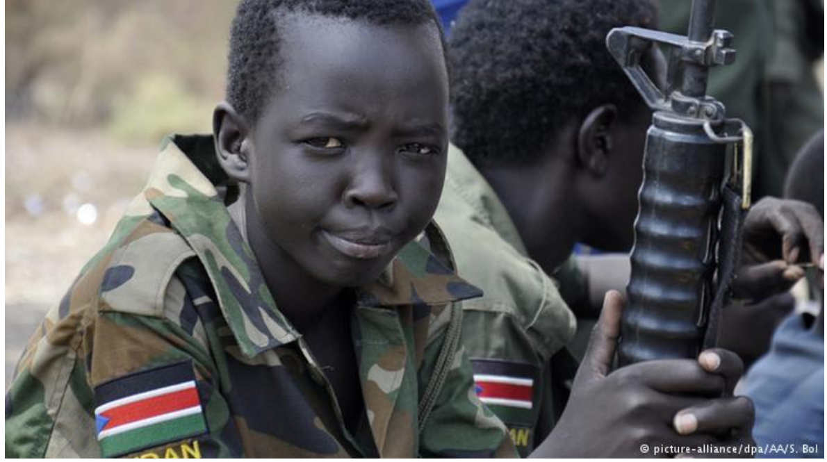
Among all the ills that afflict him, in the region there is also the problem of underage recruitment.

South Sudan, the youngest nation in the world is bleeding between conflicts, power struggles and ambitions for control of resources, facing no opposition from much of the international community. We witness with apathy a humanitarian catastrophe of enormous dimensions that a short-medium term is not peeks, rather, is expected escalating conflict due to the proliferation of new armed groups and by agitation of ethnic difference by the major players in contention. In early 2018, humanitarian disaster figures were as follows: Two and a half million South Sudanese refugees in neighboring countries, 1,800,000 internally displaced persons and 290,000 refugees from neighboring countries in South Sudan (UNHCR, March 2018). If we add the fact that the war ravaging the region for decades has turned the country into one of the poorest in the world and that this has important oil reserves, we have all the ingredients for a cocktail of violence, famine and massive displacement of civilians. It has caused the biggest refugee crisis in Africa since the genocide in Rwanda 1994. This article attempts to draw attention to the situation that takes place in this forgotten region of Africa.