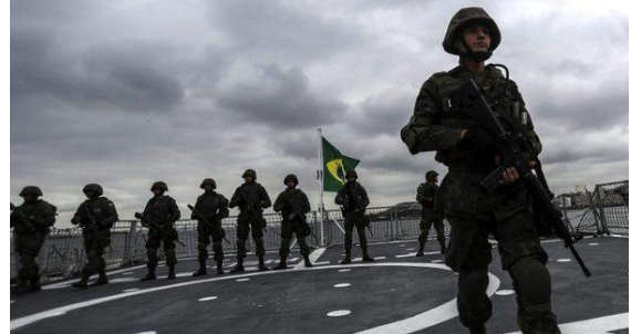
Antonio Lacerda / EPA