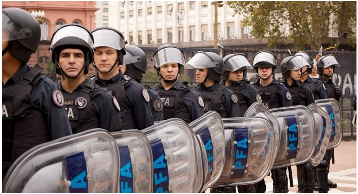
Personal Argentina Federal Police in riot gear function.

On March 5, 2018, it was published in the Official Gazette on Presidential Decree No. 174/2018, which actually performs a modification of Decree No. 357/2002 in which is seated the organizational structure (Organization and Objectives) Executive Power of the Nation Argentina.