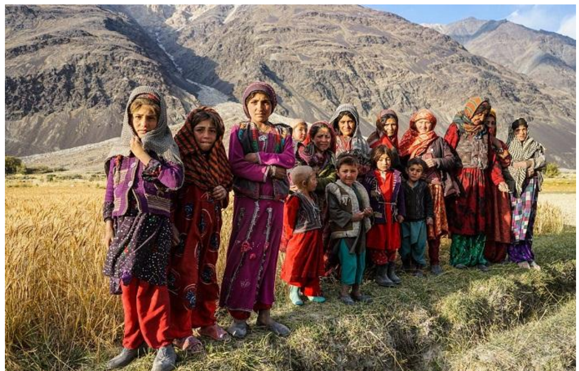
Inhabitants of Wakhan valley

A key geostrategic position in the passage between East and West has made Afghanistan a climate conducive to armed conflict territory, but also a melting pot of ethnicities, languages and cultures. With more than 25 distinct ethnic groups and a strong religious component that acts as a divisor added factor, in this article we analyze the ethnic component of the Afghan conflict and international support received by various factions. A country become a chessboard.