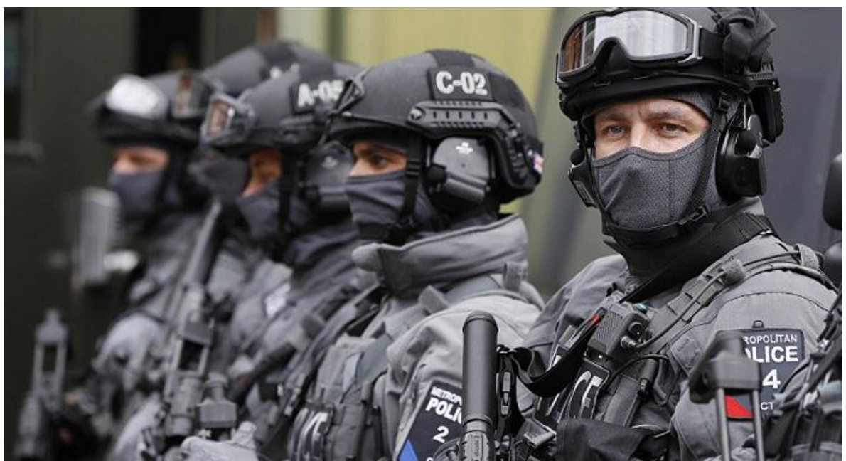
British police anti-terrorist unit belonging to.

The importance of intelligence in the fight against terrorism is based on three substantial vectors: