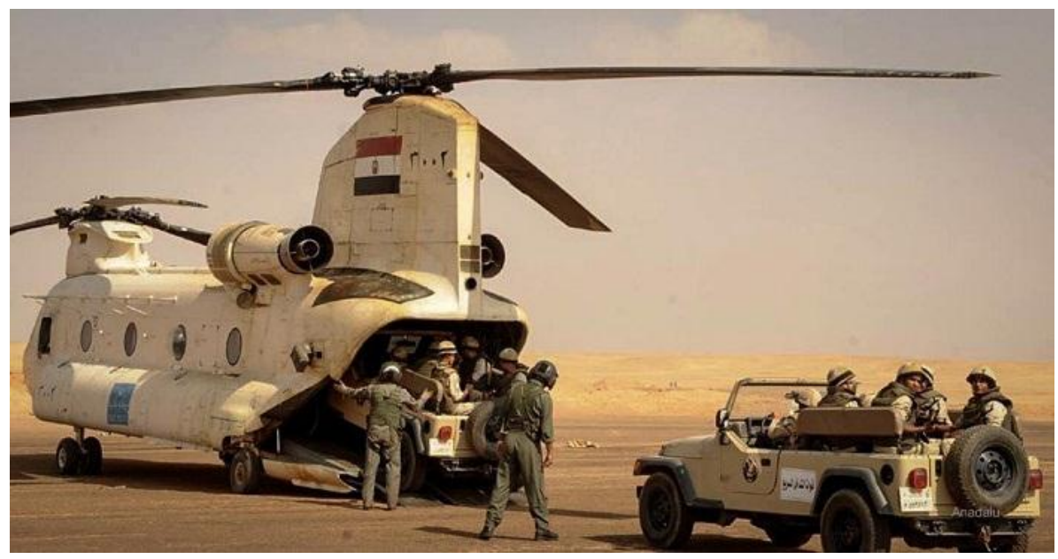
Egyptian troops in operations in the Sinai desert.

On February 9 last year, the Egyptian government launched the "military operation Integral Sinai 2018" maneuvers involving the army, navy, air force, border patrol and police forces in the country, designed to hunt down and kill to Wilāyat Sinai insurgent group swore allegiance to Daesh in 2015, formerly known as Ansar Bayt al-Maqdis (Followers of the holy House), starred in numerous attacks not only against the security forces, but against the Coptic minority and even has attacked mosques. The bloodiest of the attacks occurred in November 2017, against the al-Rauda, in northern Sinai, which left more than 300 dead and 135 wounded.