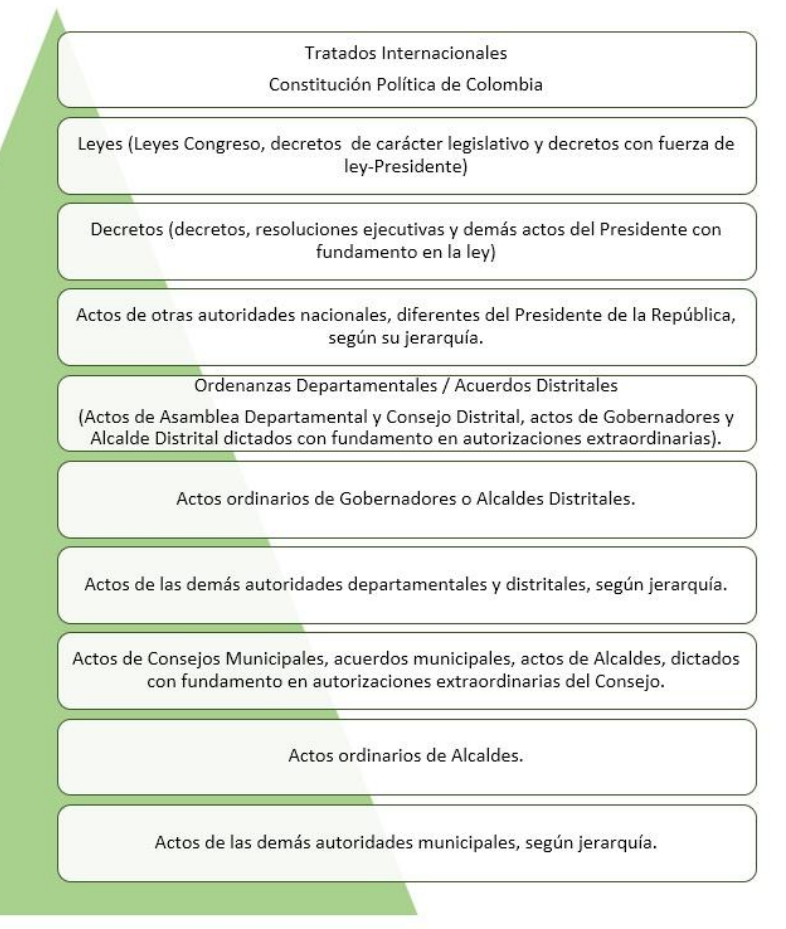
Image No. 1. Pyramid Legal or "Pyramid of Kelsen" applicable in Colombia.

According to Kelsen (1950), "the standard that determines the creation of another is superior to it; the created according to this regulation, is lower than the first (p.227), "this premise call Kelsen pyramid where you can demonstrate the priority of laws in a nation adrift." Thus, we can present the pyramid Kelsen applying in Colombia: