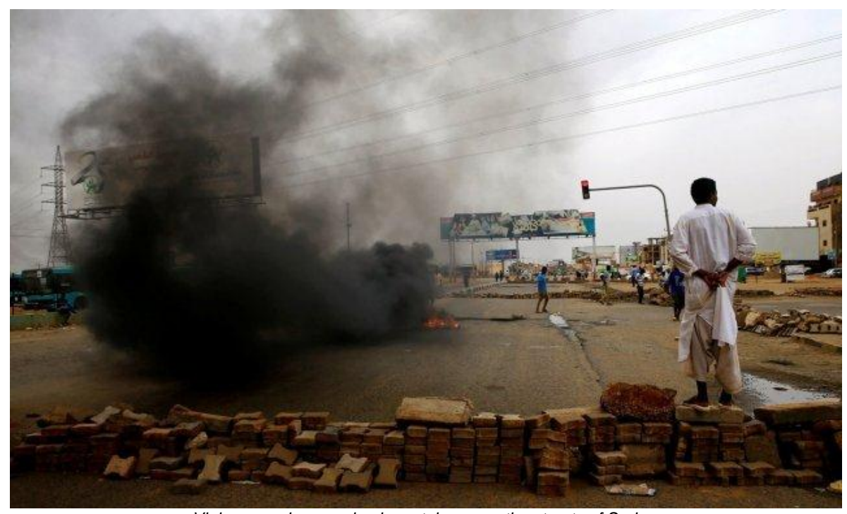
Violence and repression have taken over the streets of Sudan.

A few days after the massacre in Khartoum, Sudan rushes to late spring that began with the fall of Omar al-Bashir last April. Military Transition Council (CMT) with the excuse to accelerate the transition towards general elections to be "produced" in nine months as announced by General Abdel Fattah al-Burhan, who has ruled the agreements reached with the main block opposition, the Forces of Freedom and Change (FEC.)