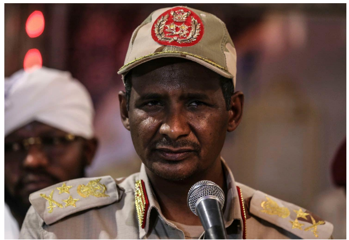
General Mohamed Hamdan Dagalo.

After the protests that began last December and hatched in April, it had closed fairly well in Sudan, for the thousands of protesters who had gathered the Khartoum and in many other cities and towns across the country, demanding the resignation of Omar al-Bashir, the autocrat who ruled the country for 30 years (See:. Sudan between the spring and the abyss)