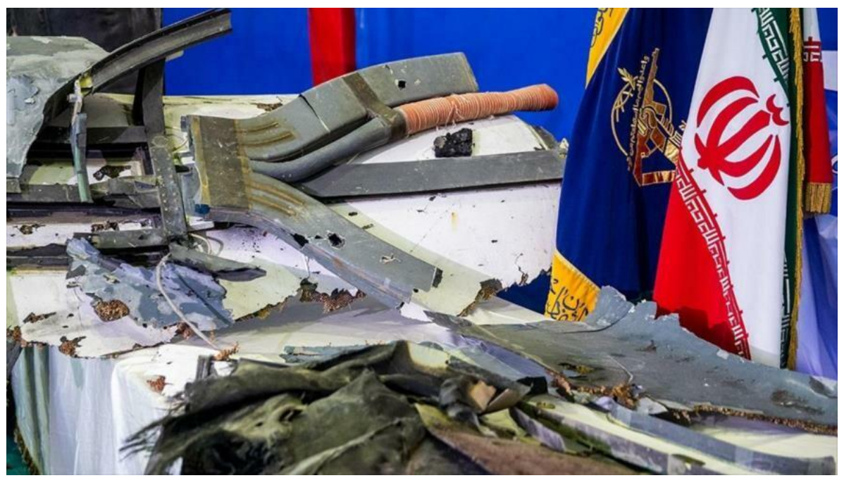
Global Hawk UAV fragments of the United States shot down by Iran in the Gulf of Oman.

International attention is focused on the strange minuet that Donald Trump dances on the waters of the Persian Gulf, threatening, launched attacks against strategic targets of the Islamic Republic of Iran, and abortándolos when the bombers were within 10 minutes of its objectives, with a degree incoherence and irresponsibility that no longer surprise the little Hitler was born in Queens, but every day the world about the possibility of a real war catastrophe.