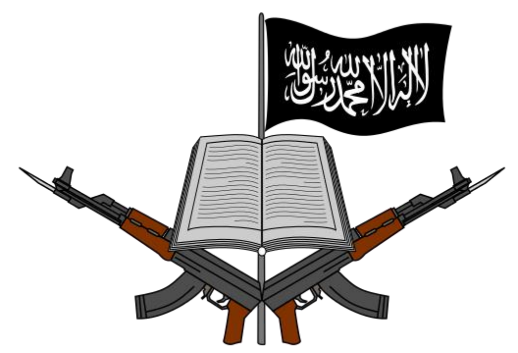
Emblem of the terrorist group Boko Haram.

Boko Haram offensive, seems endless. Since the beginning of the year there have been almost daily basis both attacks and attacks against civilians as military targets.