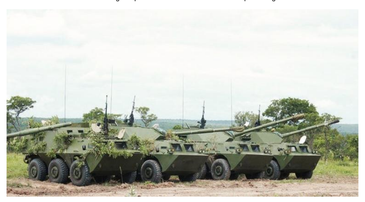
From 2011, the International Institute for Strategic Studies - IISS, said ground forces had 42 armored / infantry regiments (the strength of the units is variable) and 16 infantry brigades. These probably comprised infantry, tanks, APC, artillery and AA units as required.

The brigades were generally dispersed in battalions or smaller formations to protect the strategic ground units, urban centers, settlements and critical infrastructure such as bridges and factories. counterintelligence agents assigned to all field units to prevent the infiltration of Unita. Various army combat capabilities were indicated by their numerous brigades regular infantry and armored motorized organic or aggregates, artillery and air defense units; infantry soldier two brigades; four brigades flak; ten tank battalions; six artillery battalions. These forces are concentrated in areas of strategic importance and recurrent conflict: oil producing areas.