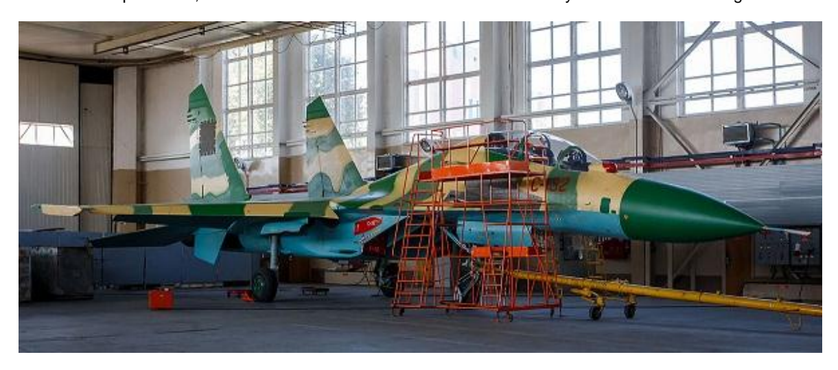
The FANA has many bases, most of them former bases of the Portuguese Air Force, and other courtesies of the Cold War.

(Angola Aeroclube) met in Luanda in October 1975. These people and aircraft left by the Portuguese air force formed the basis for the air transport industry force. The force was formally established on January 21, 1976 as the People / Antiaircraft FAPA / DAA Angola Air Force and Air Defense or (Força Aérea Popular de Angola / Air Defesa e Antiaircraft). His first batch of Soviet fighter aircraft MiG was delivered in mid-December 1975. The FAPA / DAA fought several battles with aircraft of the Air Force of South Africa in November 1981, Around 1983-85, in order to improve the combat capability of the MPLA, Romania sent 150 flight instructors and other aviation personnel, which contributed to the establishment of a Military Aviation School in Angola.