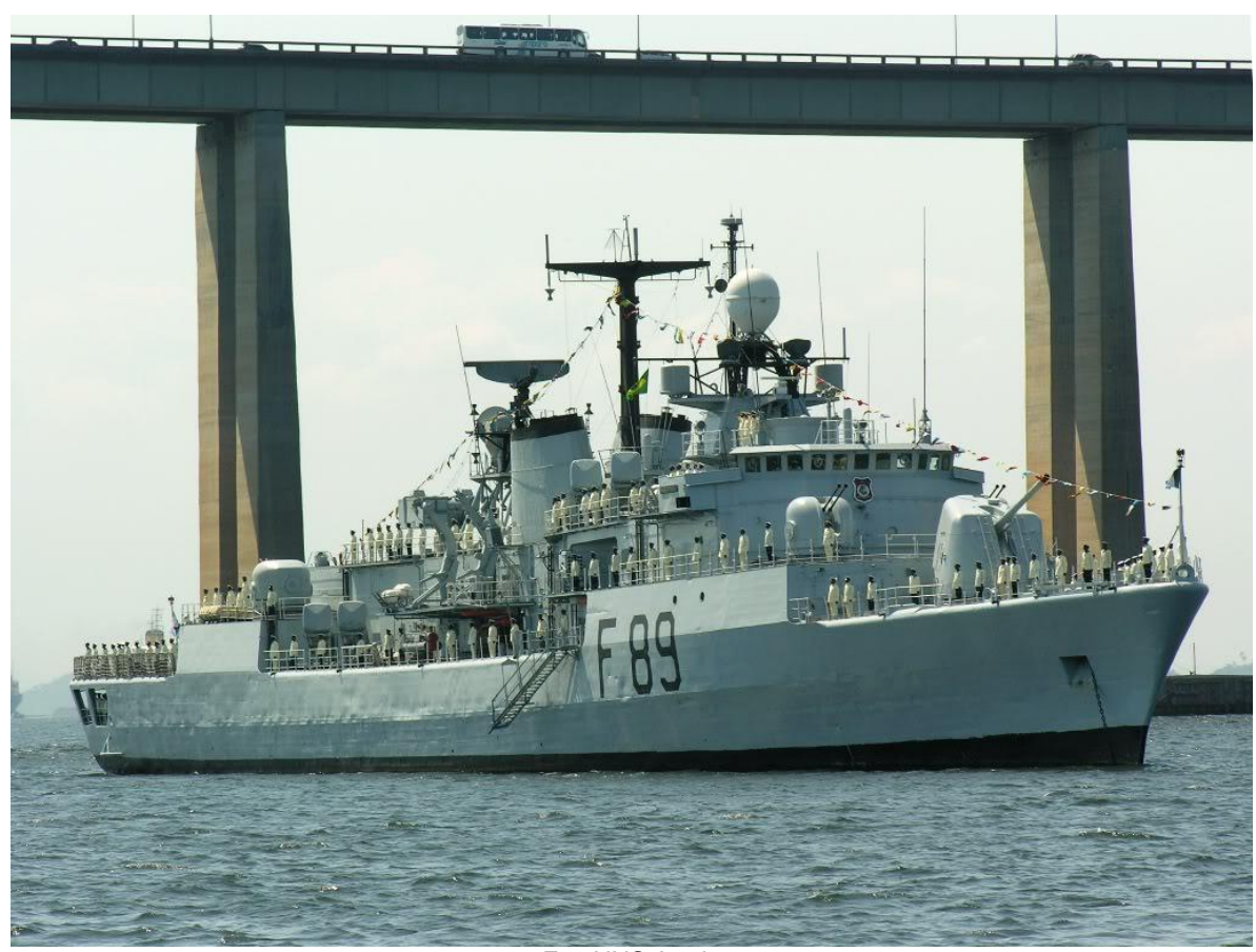
F89 NNS Aradu

4 utility helicopters shipped Augusta A109