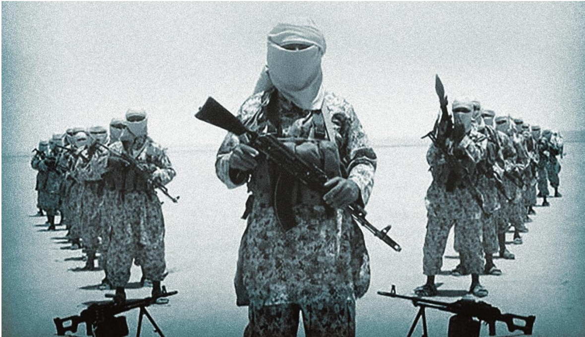
Like a hydra that does not die despite lopping off several heads, Al-Qaeda continues to be active.

As expected, in the face of the pandemic and very possible weakening of anti-terrorist systems, together with the efforts of the vast majority of nations to confront Covid-19, terrorist organizations such as al-Qaeda and Daesh, just as the neo-fascists do Europeans, have begun to encourage their partners, sleeper cells and lone wolves to activate to hit Jewish "crusaders" and the Muslims themselves, the vast majority, who do not share the Wahhabi ideology, taking advantage of what could be included in one of the latest statements from the al-Qaeda command, which has stated that the virus is "a sign of God's fury towards humanity for its sins and non-compliance with its mandate".