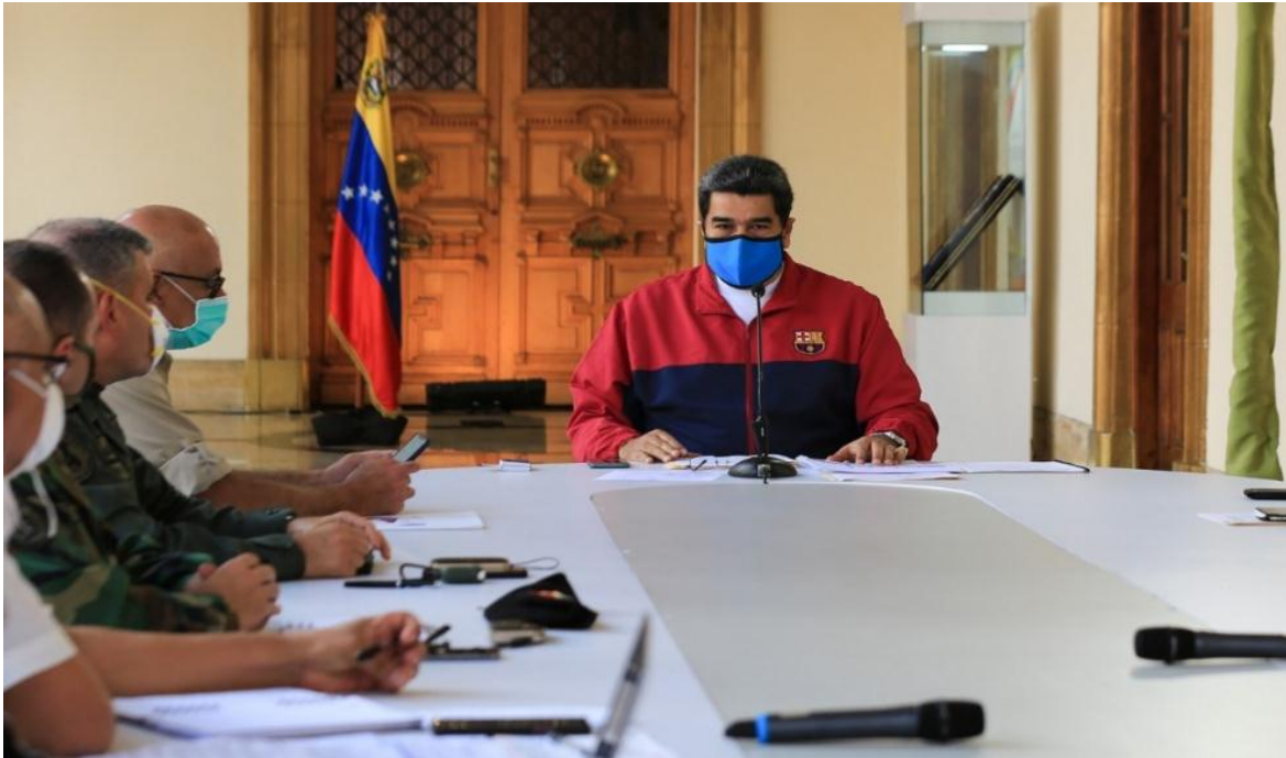
President Nicolás Maduro in a meeting with part of his work team, in times of pandemic.