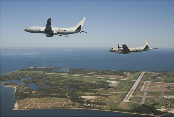
P-3 Orion and P-8

SIGINT platforms seek to effectively extract, classify and locate transmissions within the signal spectrum, they can pick up a wide range of signal types from many kilometers away, even low power pulsed signals. These signals can be categorized as friend or foe and by team type, then geolocated for intelligence on who, what, and where the signal is coming from.