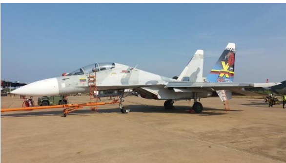
Sukhoi Su-30MkII fighter-bomber of the Venezuelan Military Aviation

Helicopters: 10 Mi35 M2 Attack and 20 Mil-17 Transport and Assault.