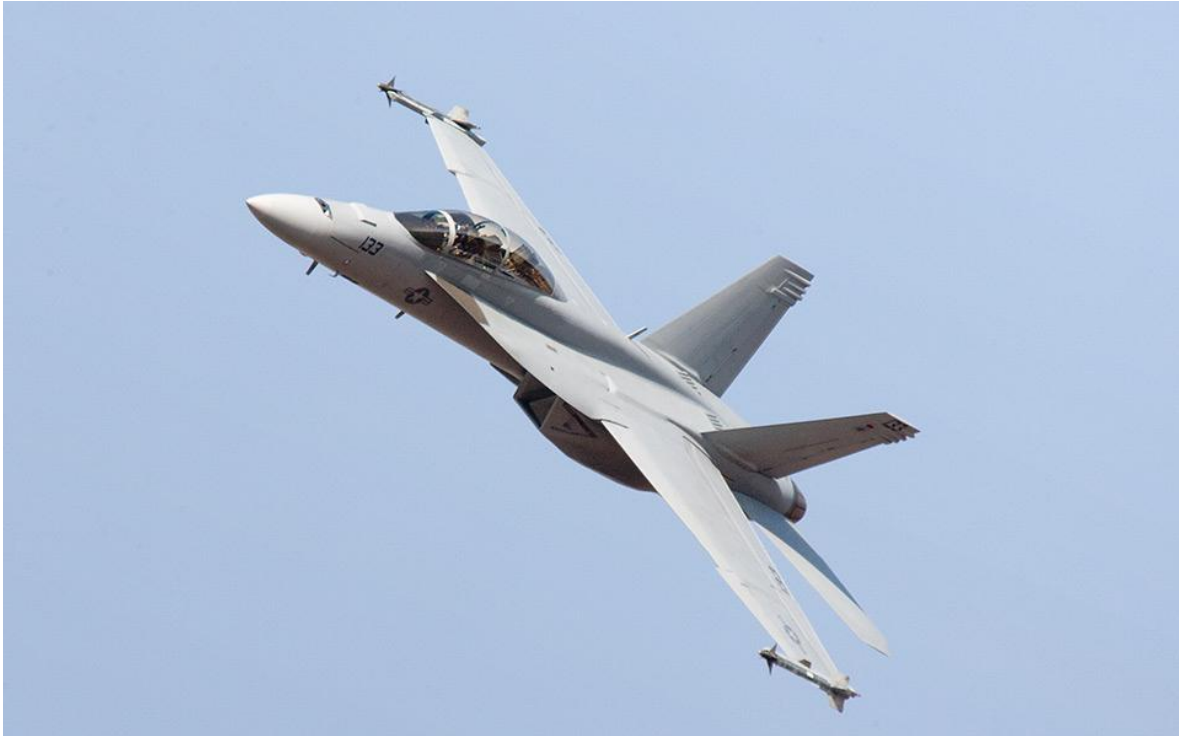
EA-18 Growler of the United States Navy

For some time now there has been talk of a possible military intervention in Venezuela, and President Trump has mentioned that it is within the range of possibilities.