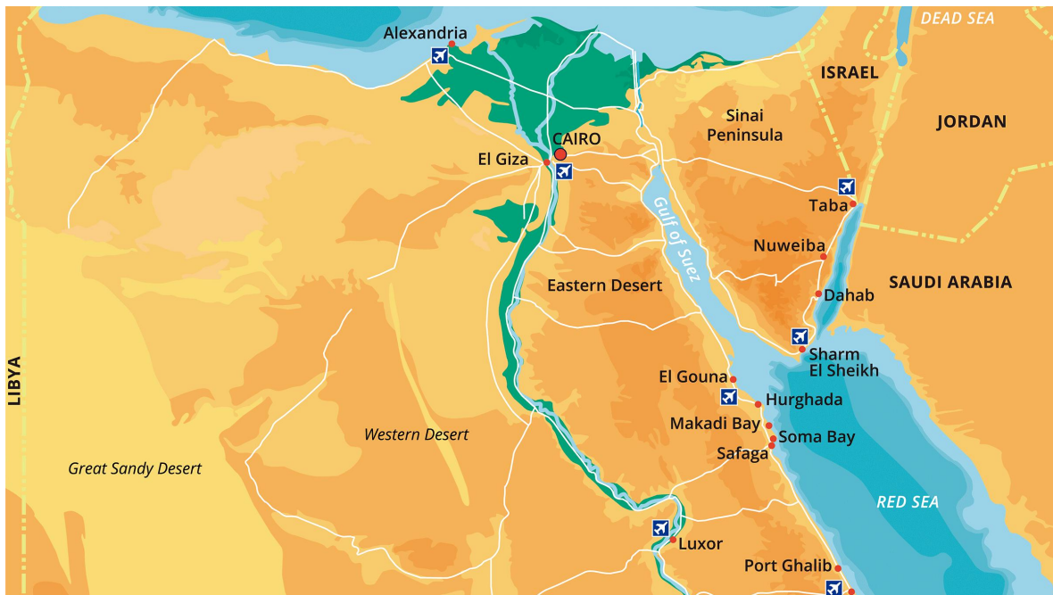
The Sinai Peninsula is located on the right bank of the Gulf of Suez and the homonymous canal.

Since February 2018, when Egyptian President Abdel Fattah al-Sisi ordered the mobilization of thousands of military personnel and security forces, in what is known as Operation Sinai, against the terrorist organization Wilāyat Sināi (province of Sinai), the world stopped having news of what is happening in a region that is slightly less than the size of Ireland, and a population of close to a million and a half people. Former General al-Sisi, the man whom none other than US President Donald Trump calls: "My favorite dictator", has decided to hide this war that is fought both in the desert and the mountains, as well as in the cities and villages, with an uncertain result regarding the costs of the civilians, put to resist alone between the two fires. Now, that the end is announced, it will be time to count the casualties of the innocent and also and the way in which that war was fought,