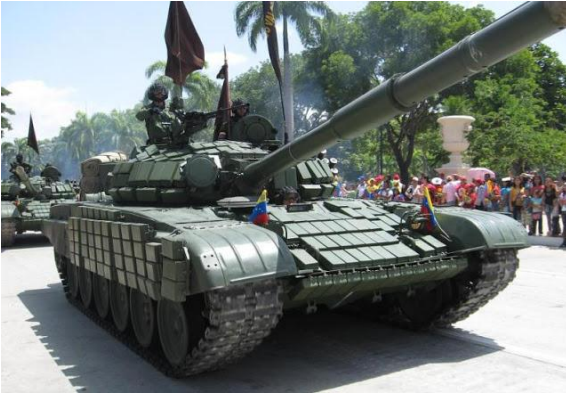
Tank of Russian origin T-72B1 belonging to the Venezuelan Army