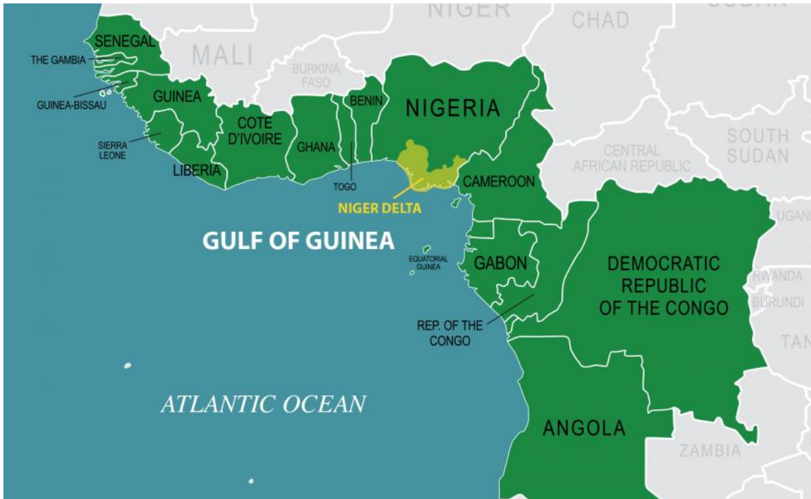
Gulf of Guinea in West Africa, the Niger River delta is highlighted in yellow .

Nigeria, with almost 200 million inhabitants, and a size slightly larger than Venezuela, seems to be a country destined to amplify to its interior, whatever crisis hits the world. In full swing after the attacks on the New York towers, Wahhabi terrorism began to spread throughout the vast geography of Islam and in 2009 the Boko group was founded in northern Nigeria. Haram , which after more than a decade continues to strike in a constant and brutal manner, having already caused more than 50,000 deaths and two million displaced persons, and reaching to radiate its terror to neighboring countries. Undoubtedly, this expansion is largely due to endemic corruption, which has endured government after government, devastating institutions and causing appalling levels of social inequality, with