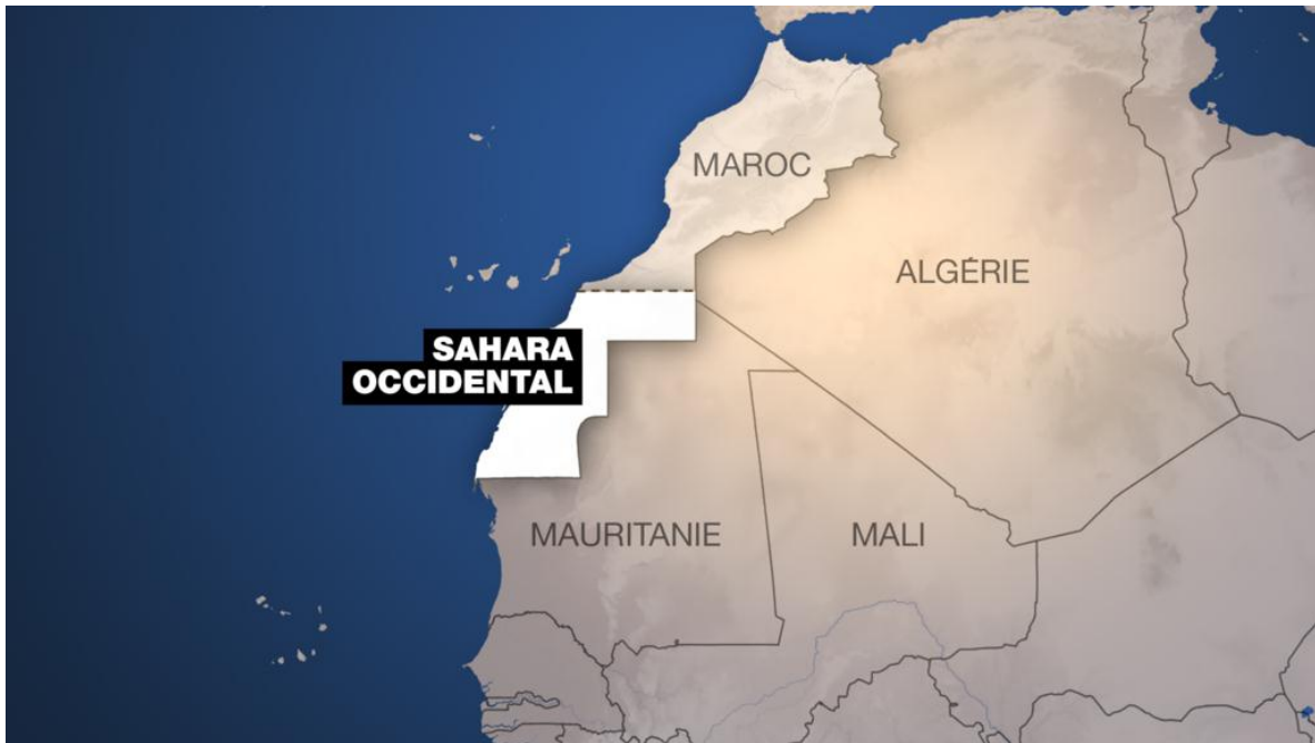
Geographical location of Western Sahara, west of Africa and on the shores of the Atlantic Ocean.

A slight diplomatic friction between Algeria and the Moroccan Alawite monarchy, brought to the memory of some the tragedy of the Saharawi people, who in 1975 were stripped of a large part of their territory. The newly installed King Juan Carlos, who practically began his reign with a betrayal of his mentor, the genocidal Francisco Franco, who had agreed to the independence of the West African colony; tried to avoid a trap that the United States was preparing with Morocco, to seize those 266 thousand square kilometers, of stone and sand, but with a subsoil of important deposits of phosphates, iron, oil and gas. With more than a thousand kilometers of coastline on the Atlantic Ocean, facing one of the richest fishing banks in the world, today mainly exploited by Moroccan and Spanish companies. That territory, of a size similar to New Zealand, in that world