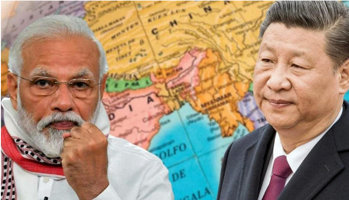
Narendra Modi and Xi Jinping leaders of the two opposing powers.

The lacerating stigma of colonialism seems to persecute, beyond the time that has elapsed, all the peoples who have suffered it and as an indelible trace emerges with a bloody vocation with each shake that occurs in those geographies, harassing cultures, nations, ethnic groups and tribes, which in one way or another continue to ruin, the examples number in the hundreds of thousands, so much so that perhaps we will never be able to completely remove that tombstone that the British Empire, in particular, has thrown over the world.