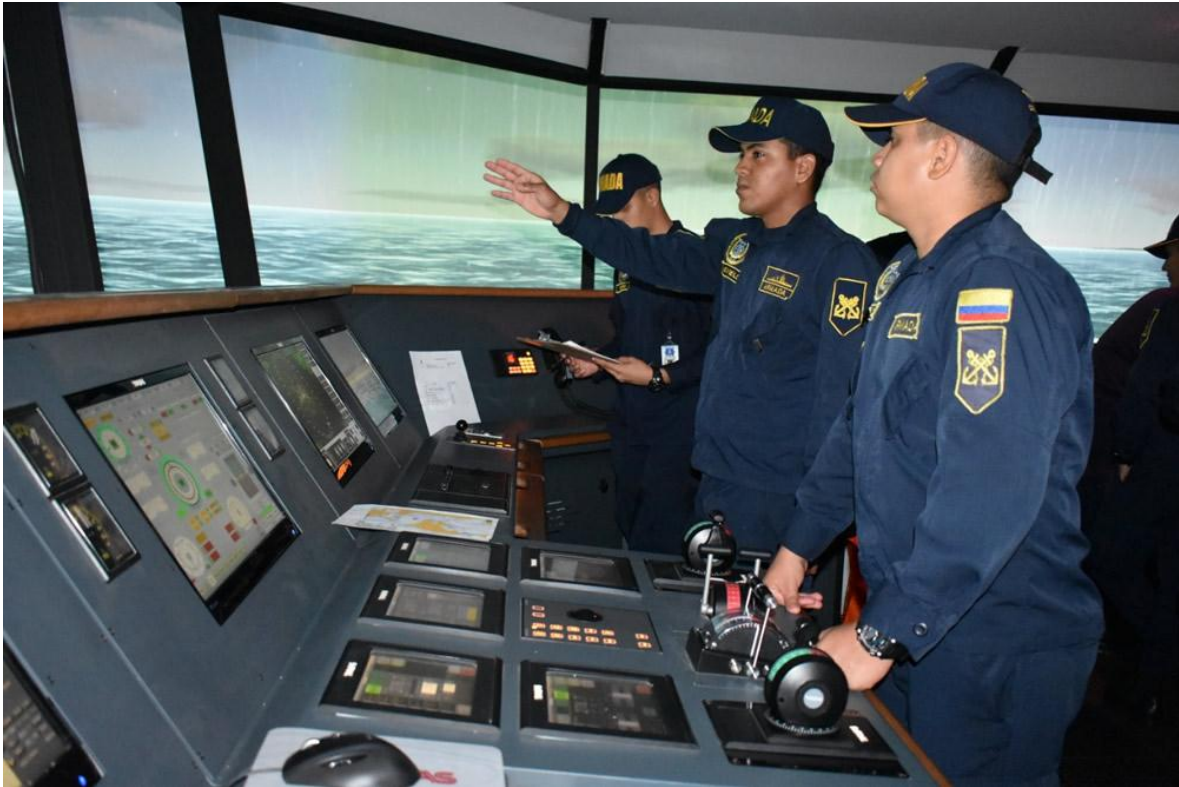
The ENAP Full Mission Bridge Simulator

The Naval School of Cadets "Almirante Padilla" - ENAP, located in the city of Cartagena de Indias, is where the future officers of the Colombian National Navy are trained. In addition, it is a center of excellence where important dependencies of the National Navy are based. Such is the case of the Research, Development and Innovation Center for Maritime Activities - CIDIAM, which operates a simulation center within ENAP.