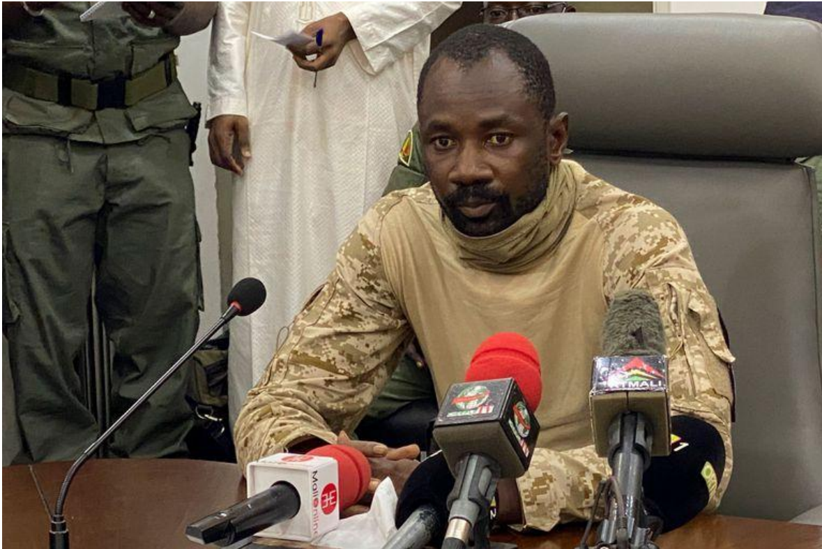
Colonel Assimi Goita , visible leader of the recent coup in Mali.

On the morning of last Tuesday the 18th, after the break-in of several vans with armed men led by Colonel Assimi Goita at the Soundiata military base near the city of Kati, in the Kulikoró district , about twelve kilometers north of the city of Bamako, the capital of Mali, a brief exchange of fire began between the guard and the raiders who recognized themselves as members of the National Committee for the Salvation of the People (CNSP), also men from the army. The confusion was quickly cleared up, the arsenals were opened, the troops were armed, and the invading column left for the capital again, with ten more vans loaded with heavily armed troops.