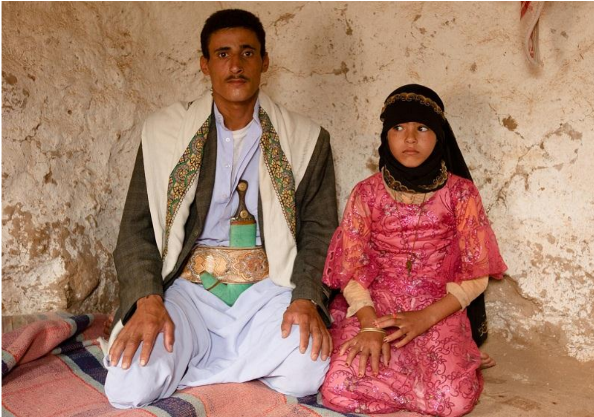
Child marriage is a tradition highly questioned by Westerners.

A wave of indignation seems to shake the good consciences of the world, according to what can be read in the mass media, upon learning of the news that a law that would legitimize marriages between adults and minors is being debated in the Somali parliament. Although the law could defeat the efforts of many international agencies and NGOs to prevent this type of practice, it will take a lot of energy and time, fundamentally, so that these kinds of unions, an ancient custom on the other hand, can be extinguished. Since almost fifty percent of the young women are delivered in these marriage classes before turning 18, after paying the bride's family a dowry, which consists of cattle or money. Given the current situation in the country: