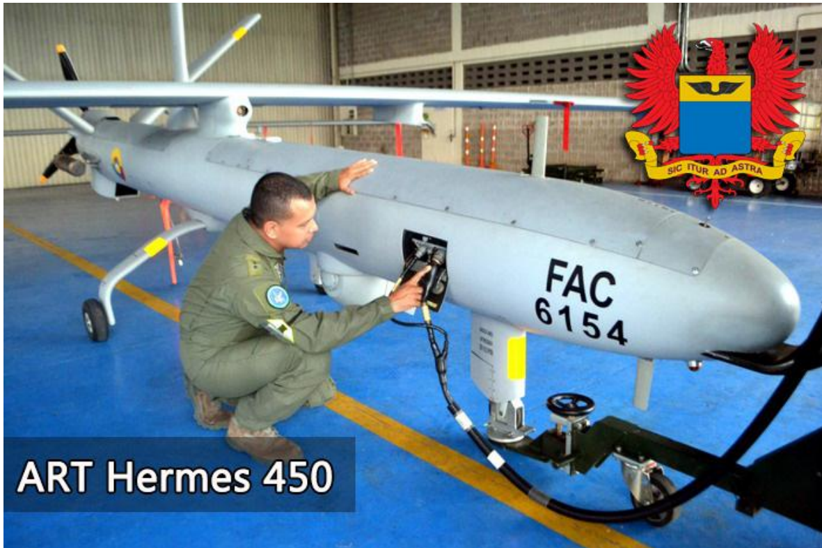
ART Hermes 450

In 2018, two important news were recorded on the subject of drones in Colombia, the first was the inauguration of the Basic School of Remotely Manned Aircraft (EBART), and the other the activation of an ART Squadron in the Department of Nariño, southwest of Colombia, opening an ART launch base there.